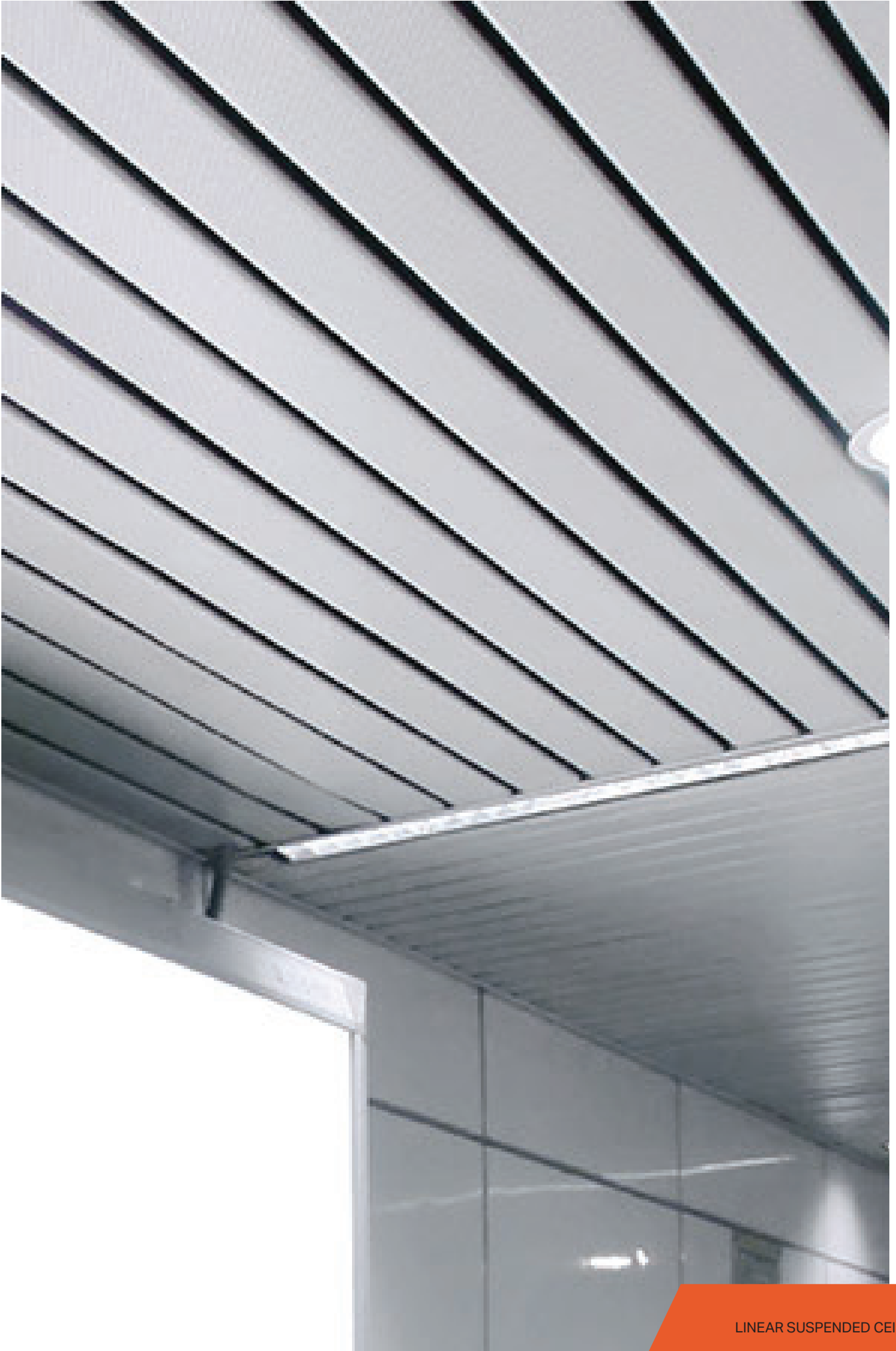
LINEAR SUSPENDED CEILING